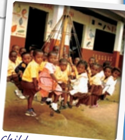
Children at our partner school in Ghana

We also work closely with local secondary schools, using their specialist teachers and resources to enrich our curriculum. These good links help to ensure an easy transition when it is time for children to move on.