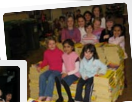
Recycling Yellow Pages