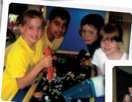
Learning about recycling