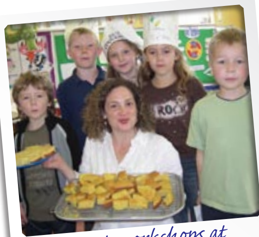
Parent workshops at World of Food Day

An active school council gives children the opportunity to participate in the life of the school, and to experience democracy in practice.