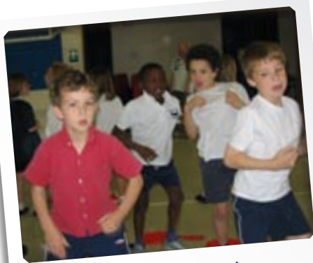
Junior Dance Day