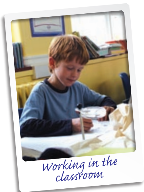
Working in the classroom

Our academic performance is very good and value added figures illustrate the children's excellent achievement during their time at the school.