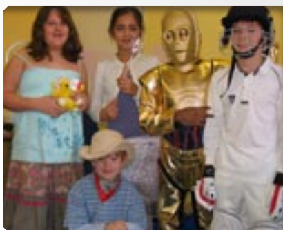
Fancy Dress ~ Be what you want to be