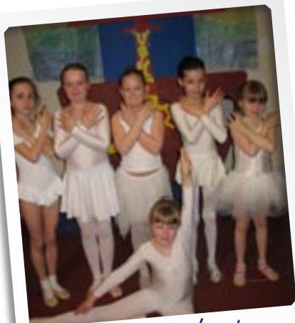
The Rainboat production