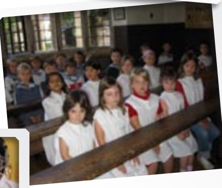
A Victorian Day