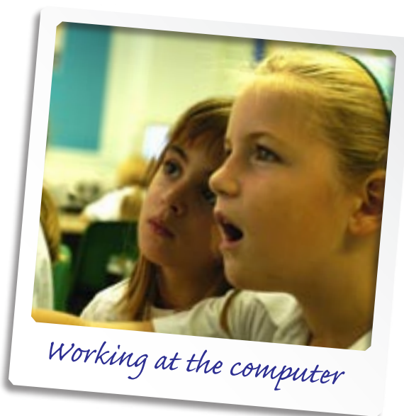
Working at the computer

'Achievement is good and standards are above average'