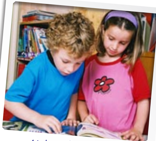
Using the library

We have a large playing field and a sports pavilion about 300 metres from the main school buildings. These are used for PE lessons and extra-curricular activities throughout the year, as well as for special events like sponsored walks, picnics and sports days.