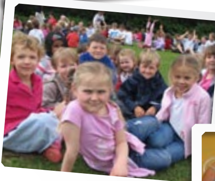
Fun on the field