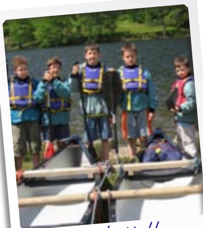
Marle Hall residential visit

‘The good curriculum contributes well to the pupils’ good achievement and enjoyment of their education’