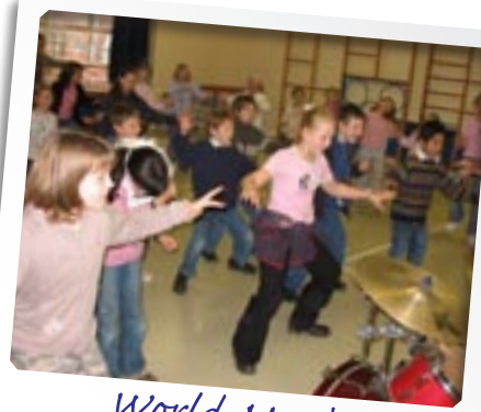
World Music Workshops